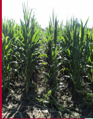
No till corn with cover crop