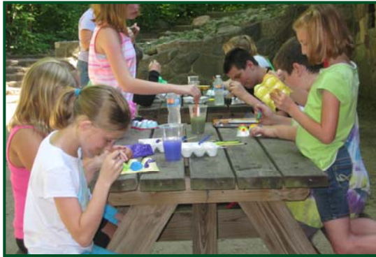
Painting bird feeders for Conservation Camp at Pokagon State Park.

All three 2016 Conservation Camps were a great success this year! Camps were hosted and sponsored by the DeKalb County, LaGrange County, Steuben County, and Whitley County Soil & Water Conservation Districts. Each camp offered a different conservation message & recreational opportunity.