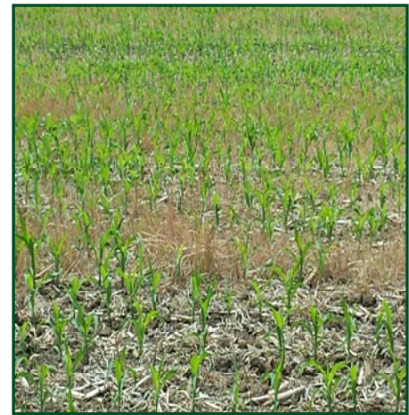
No-till field from the Steuben County 2016 spring tillage transect.

In fields planted to corn in 2016, the use of No-till was 49%, Mulch-till 13%, Reduced-