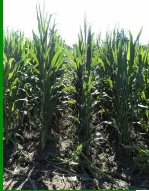
No till corn with cover crop