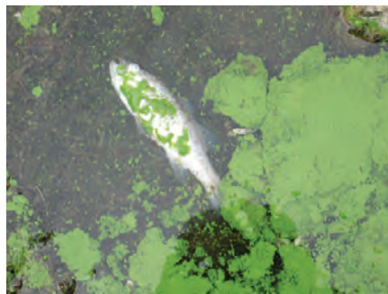
Harmful algal bloom in an Iowa reservoir used for recreation, August 2006.