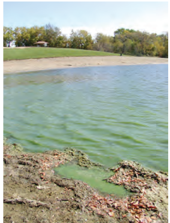
Harmful algal bloom in a Missouri reservoir used for drinking-water supply and recreation, October 2001.

Freshwater and marine harmful algal blooms (HABs) can occur anytime water use is impaired due to excessive accumulations of algae. HAB occurrence is affected by a complex set of physical, chemical, biological, hydrological, and meteorological conditions making it difficult to isolate specific causative environmental factors. Potential impairments include reduction in water quality, accumulation of malodorous scums in beach areas, algal production of toxins potent enough to poison both aquatic and terrestrial organisms, and algal production of taste-and-odor compounds that cause unpalatable drinking water and fish. HABs are a global problem, and toxic freshwater and (or) marine algae have been implicated in human and animal illness and death in over 45 countries worldwide and in at least 27 U.S. States (Yoo and others, 1995; Chorus and Bartram, 1999; Huisman and others, 2005).