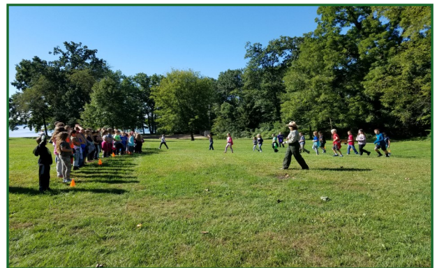
2018 Youth Conservation Field Day at Pokagon State Park - Wildlife Station