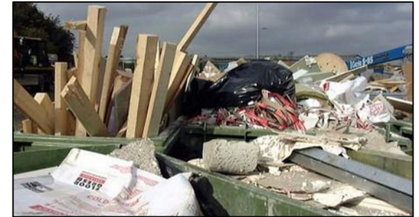
Construction waste consists of unwanted material produced directly or incidentally by construction.