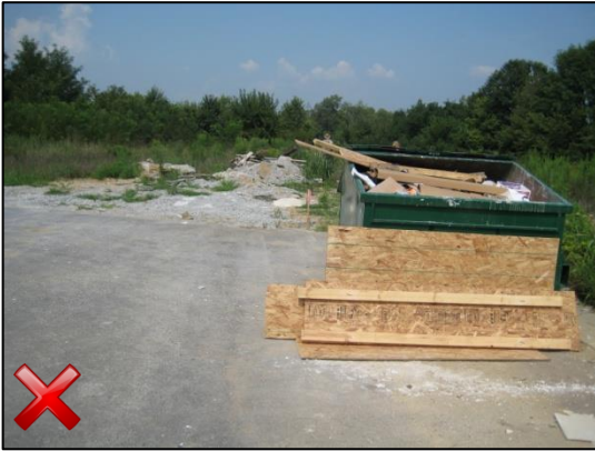
Large pieces of construction waste should be broken down and placed inside the designated disposal dumpster. Material piled up in the background should also be placed in the dumpster.