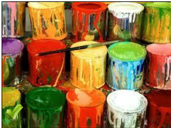
Unused latex paint should be opened to air-dry before disposing into dumpster. Make sure paint is opened in a confined area and that there is no possibility that it could be spilled onto the ground or into or near the drainage system. It is illegal to dump or rinse paint into the stormwater system.