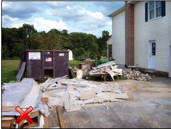
Waste material is not placed inside the dumpster, allowing trash to blow around the site area and onto adjacent land. Trash is exposed to rain, which could wash pollutants into the drainage system.