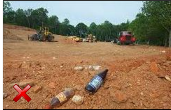
Food and beverage containers are among the items considered construction waste.