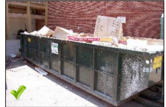
Majority of the construction waste is contained inside the dumpster. Liquids should never be emptied in the dumpster.