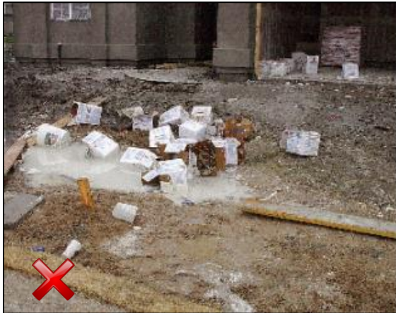
Poor trash management. Polluted runoff from the site can contaminate streams and other bodies of water.

Improper construction waste management can result in fines and other penalties. Keep your site clean.