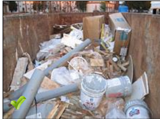
The EPA estimates that only 20% of construction and demolition debris waste is being recycled. Proper recycling can free up space within a dumpster and reduce the number of dumpsters needed.

NOTE: Limbs and woody debris collected from site clearing activities may only be burned when allowed by federal, states, and local regulations. Always check with the local fire marshal prior to any burning activity. It is never acceptable to burn anything other than woody debris that is completely free of glues, chemicals, and other man-made products.