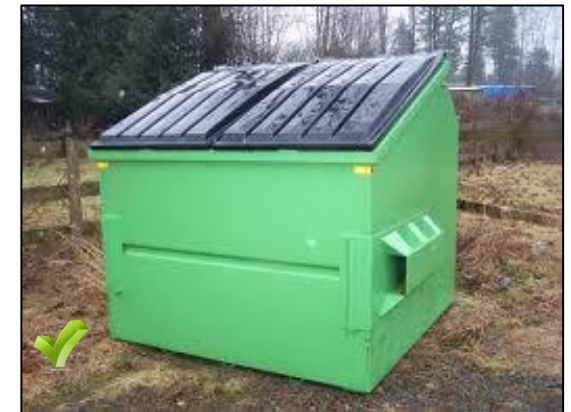
Dumpsters should be covered when not in use so pollutants inside the dumpster are not released during a rain event.