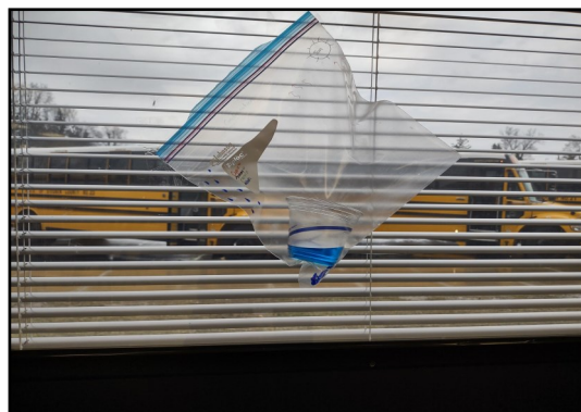
ABOVE: Water cycle in a bag demonstration. This simple science experiment is a fun and easy way to teach students about the water cycle and how it works.

discussed included aquatic macro-invertebrates, pollinators, soil, water availability, and the water cycle.